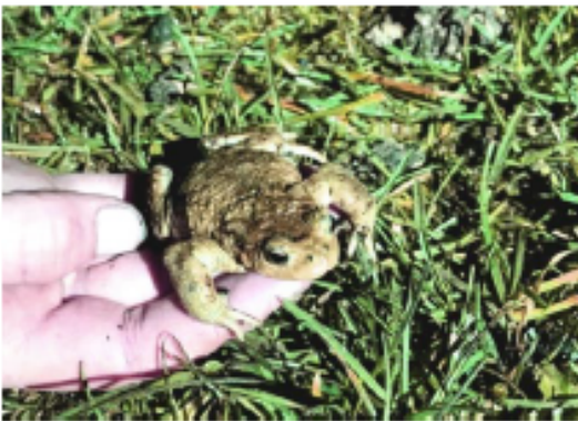
Male toad migrating to breeding pond, Wootton 2003

Like all amphibians the toads will have hibernated in woods and gardens around Wootton, which is a great area for them. The stone walls and wooded areas give them lots of places to hide away for the winter. When the temperature gets above 6 degrees at night, they travel to their breeding pond.